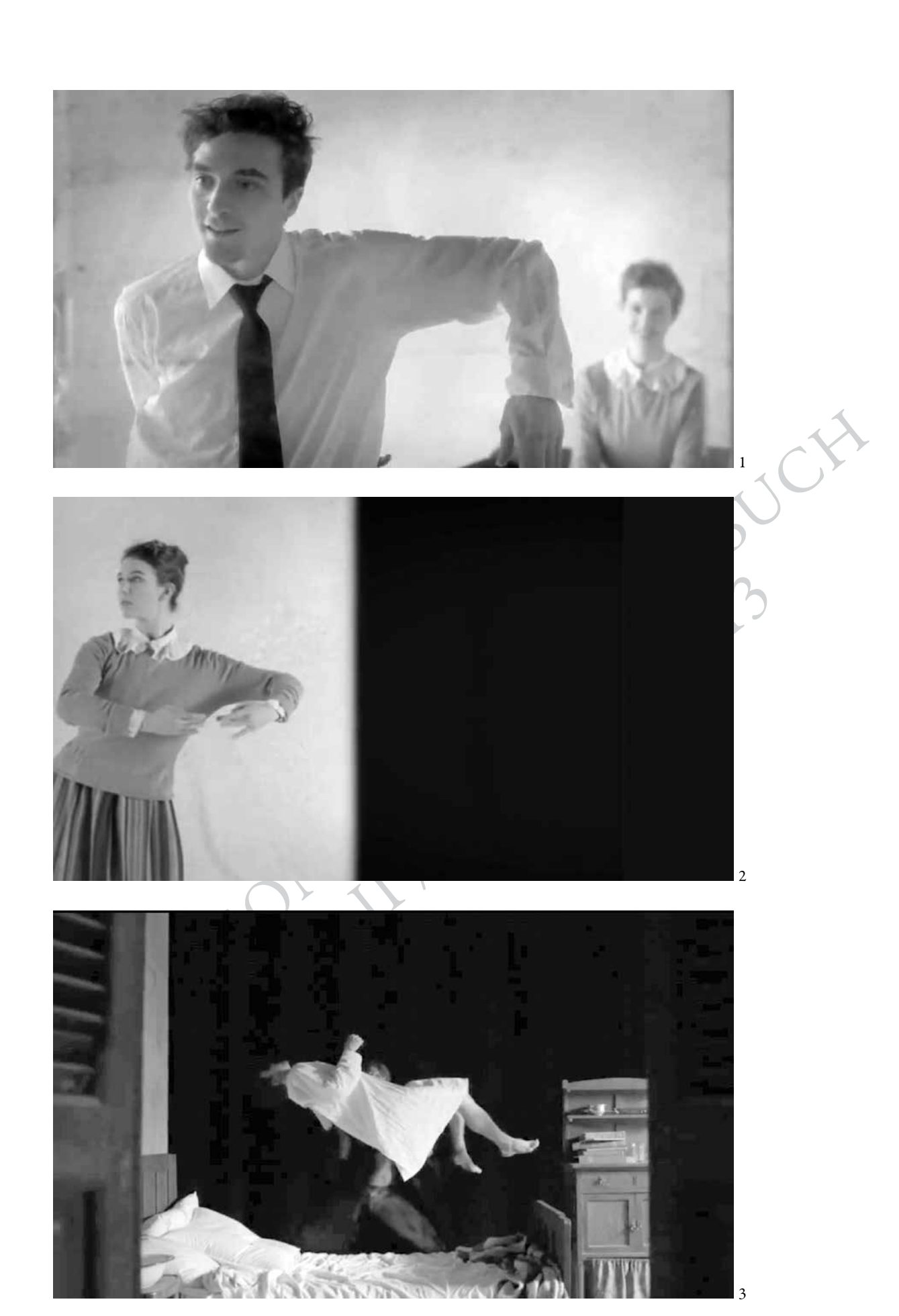
Fig. 1 – 3 Pictures from the dance-movie EGON.